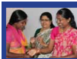
2010 Women's Retreat in India included meals, worship, teaching and even facials and a fashion show!

This session was followed by beauty care. Most of them had never been to a Beauty Parlor. There was so much giggling and some were very shy but all the delegates got a facial done. Each one was presented a towel for their personal use. At the evening session I spoke on "You are More Valuable than Pearl." Each woman received a necklace and a pair of bangles made of pearls. The fact that God cares about them so much that Jesus gave His very blood as a ransom to redeem them was not known to most of the women. There was an intense stirring in many hearts. Several made a commitment.